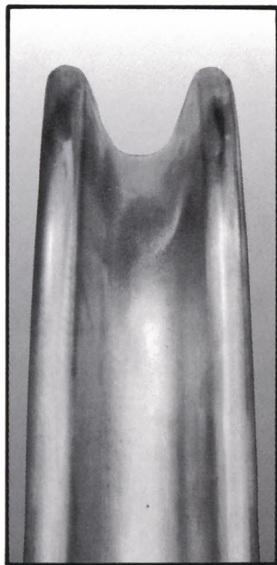
This heat treated forged sheave shows a polished groove condition even after delivering many times the service life of a soft sheave.