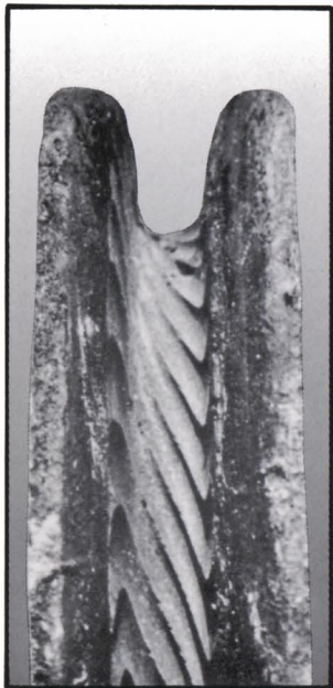
This "soft" cast sheave has developed severe corrugation which causes rapid wire rope destruction.

Hardening of the rope groove not only increases sheave life but greatly increases rope life. Ordinary soft cast or fabricated sheaves quickly develop corrugations that cause extreme abrasion and rapid wire rope destruction. Hardening of the rope groove, especially by McKEES ROCKS FORGINGS exclusive DEEP HARDENED™ process will extend rope life many times over that experienced with soft castings or fabrications.